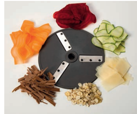
Shaving cut (HS)

SM-5 1.5 mm 1/32" & 3/16" SM-5 2.5 mm 5/64" & 3/16" SM-5 3.5 mm 1/8" & 3/16" SM-5 4.5 mm 5/32" & 3/16" SM-5 5.5 mm 3/16" & 3/16" SM-5 6.5 mm 15/64" & 3/16"