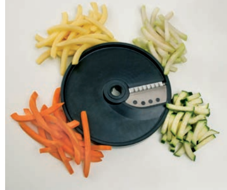
Vegetable sticks (BT)