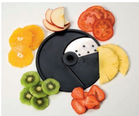
Tomato slicer (TO)

G3-5 3 mm 1/8" G6-5 6 mm 15/64" G10-5 10 mm 3/8" G4-5 4 mm 5/32" G8-5 8 mm 5/16" G12-5 12 mm 15/32"