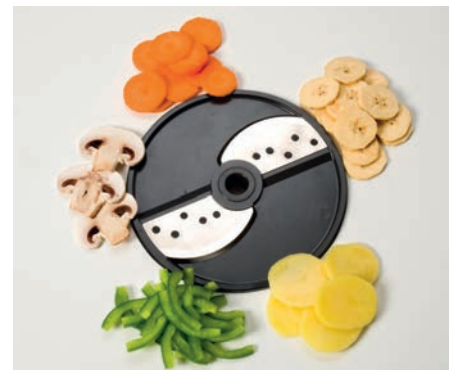
Coarse cut (G)

G3-5 3 mm 1/8" G6-5 6 mm 15/64" G10-5 10 mm 3/8" G4-5 4 mm 5/32" G8-5 8 mm 5/16" G12-5 12 mm 15/32"