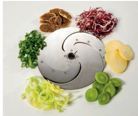
Sickle blade (SM)

SM-5 1.5 mm 1/32" & 3/16" SM-5 2.5 mm 5/64" & 3/16" SM-5 3.5 mm 1/8" & 3/16" SM-5 4.5 mm 5/32" & 3/16" SM-5 5.5 mm 3/16" & 3/16" SM-5 6.5 mm 15/64" & 3/16"