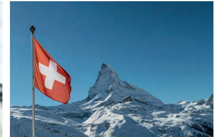
Quality Swiss products

Brunner-Anliker appliances for professional applications work precisely and reliably while offering optimum user comfort. Thanks to their durability and reliability, they are often used for generations in many companies. Our machines comply with the most stringent safety aspects and are easy to operate and clean.