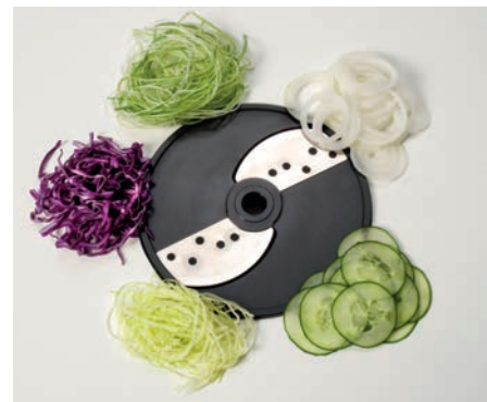
Fine cut (F)