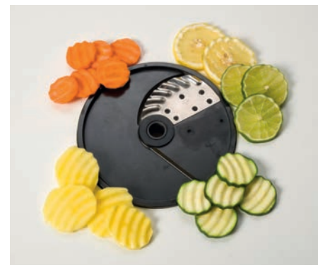
Wave cut (SU)

BR3-5 3 mm 1/8" BR4-5 4 mm 5/32" BR5-5 5 mm 13/64"