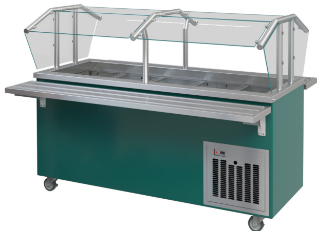
R5-BCM shown with optional dual RSRTS and RBPGC

The Piper Bloomington Cold Food Unit features an extra deep cold pan of 9-7/16" deep and is listed NSF/ANSI Standard 7. The Bloomington Cold Units are designed to serve a variety of refrigerated food products, these units are ideal as a salad bar merchandiser. Reflections units are compatible and will interlock with other Reflections units.