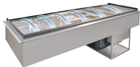
4CB-DI - fully insulated Cool Breeze Drop-in