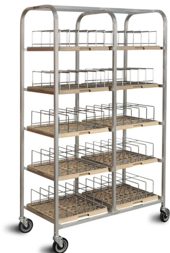
411-1151 or 190-1077

The Piper Dome Storage Carts are a practical way to store and dry plastic, plastic single wall and most insulated style domes. The molded underbases can be stored in the same fashion.