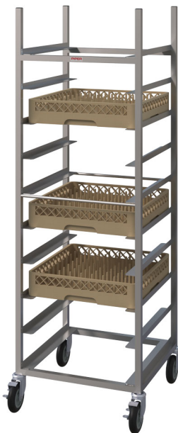
210 with Racks

Piper's Open Racks provide strength and excellent versatility at an economical price. Featuring all-aluminum construction and welded panels, these racks have double-welded side glides for added strength and rigidity.