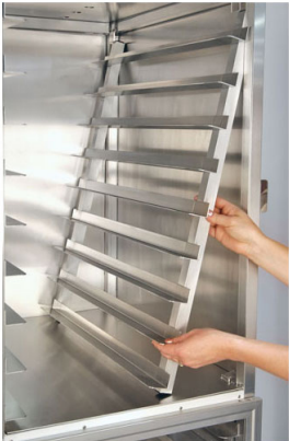
Interior racks are easily removed for cleaning and maintenance