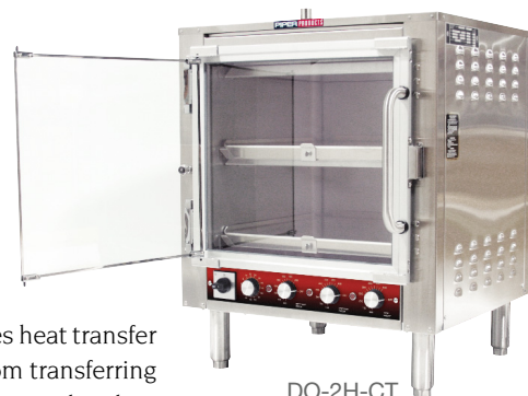
DO-2H-CT 2 half-pan Deck Oven with Cool Touch Heat Shield