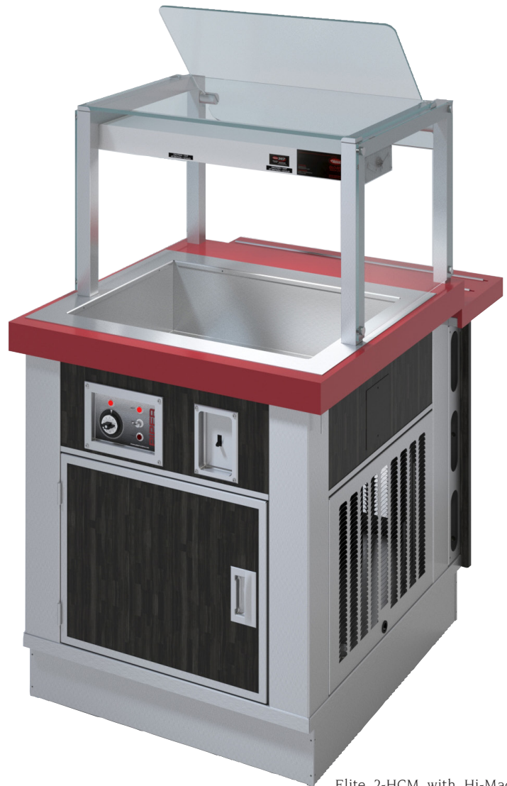
Elite 2-HCM with Hi-Macs® solid surface top and tray slide, laminated panels, and adjustable guard

Flip the switch today and start experiencing Piper innovation at its finest.